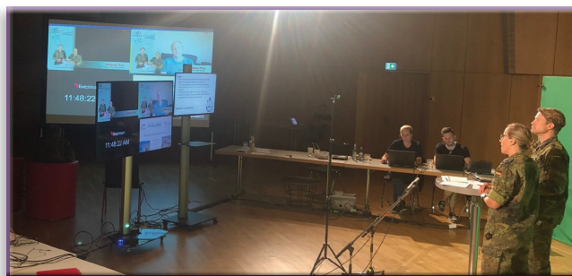
Setting of one of the session rooms at the virtual CMC conference.